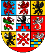
Pomeranian Coat of Arms