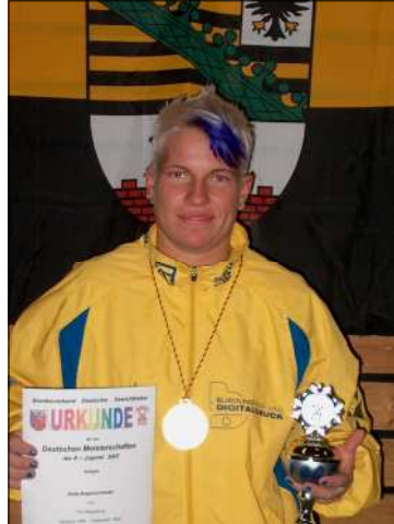
Strongest Bogenschneider Woman