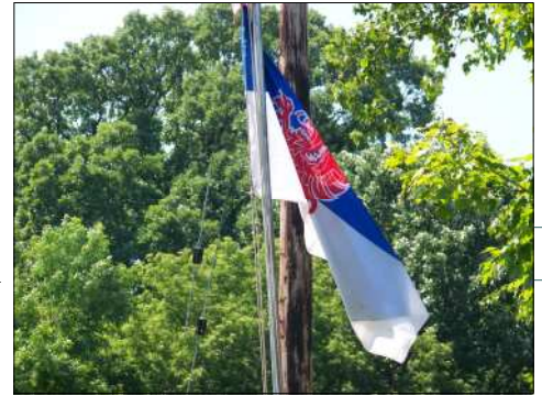
Raising of the Pomeranian Flag